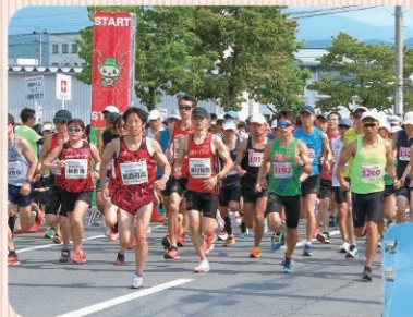
●Sagae Sakuranbo Marathon